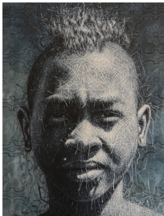
Left: Alexi Torres - Sun Light (2016)