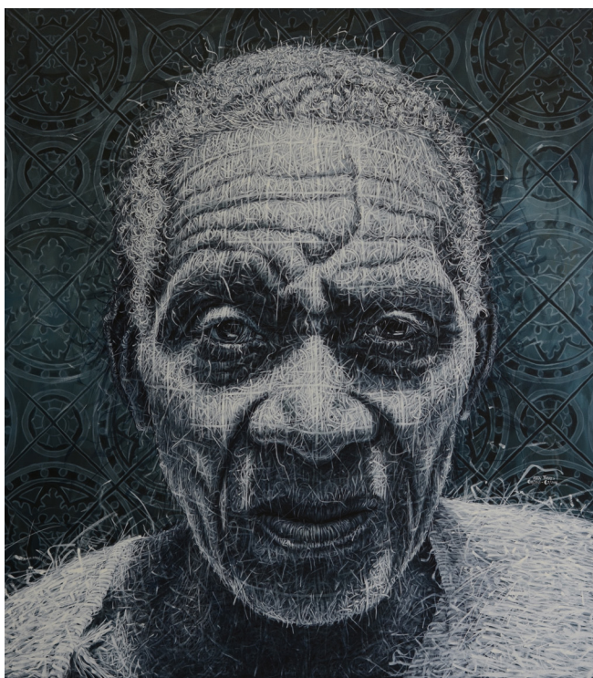
Alexi Torres - Sun Light - Domingo (2016) Oil on canvas 72 x 64 in. | 183 x 163 cm.

The central jewel in the crown of Miami Arts Week, Art Basel attracts celebrities, high-end collectors and fashionistas from all over the globe. But it is not the only game in town. Across the bay in Wynwood, known as Miami’s Arts District, there were several art fairs showcasing new, provocative and courageous works by emerging artists.